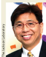
The Jackson Laboratory