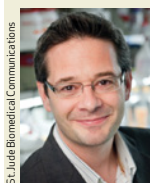
St. Jude Biomedical Communications

Liu primarily studies the functional genomics of breast cancer.